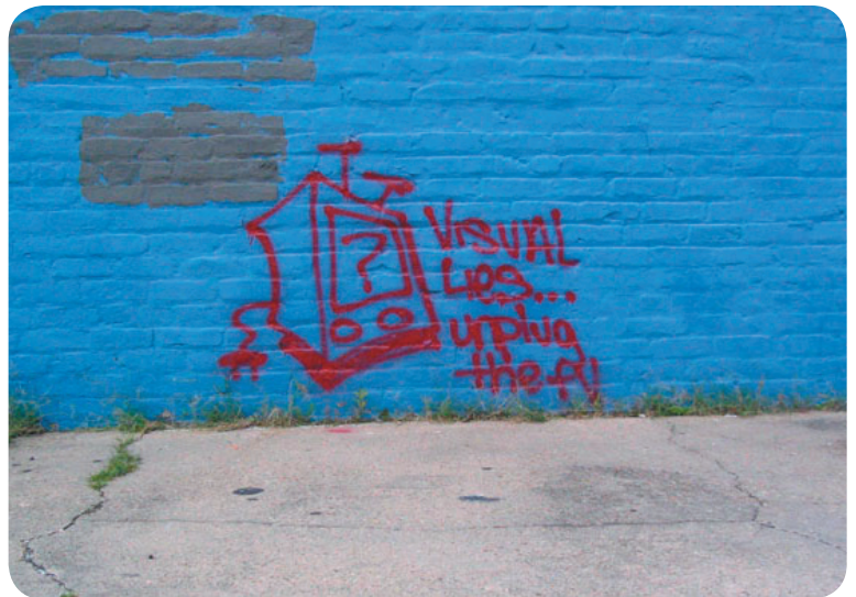
Visual Lies...Unplug the TV

It is sometimes very difficult for the founders of organizations to relinquish control over something they have nurtured and built. However, any business or organization can only go so far without new talents and thinking. For the Urban Conservancy, the time to grow is now. We are thankful to everyone who has helped us add talented people to our team. We