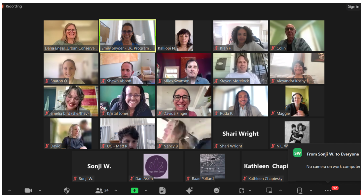
Front Yard Initiative workshop participants at our February workshop