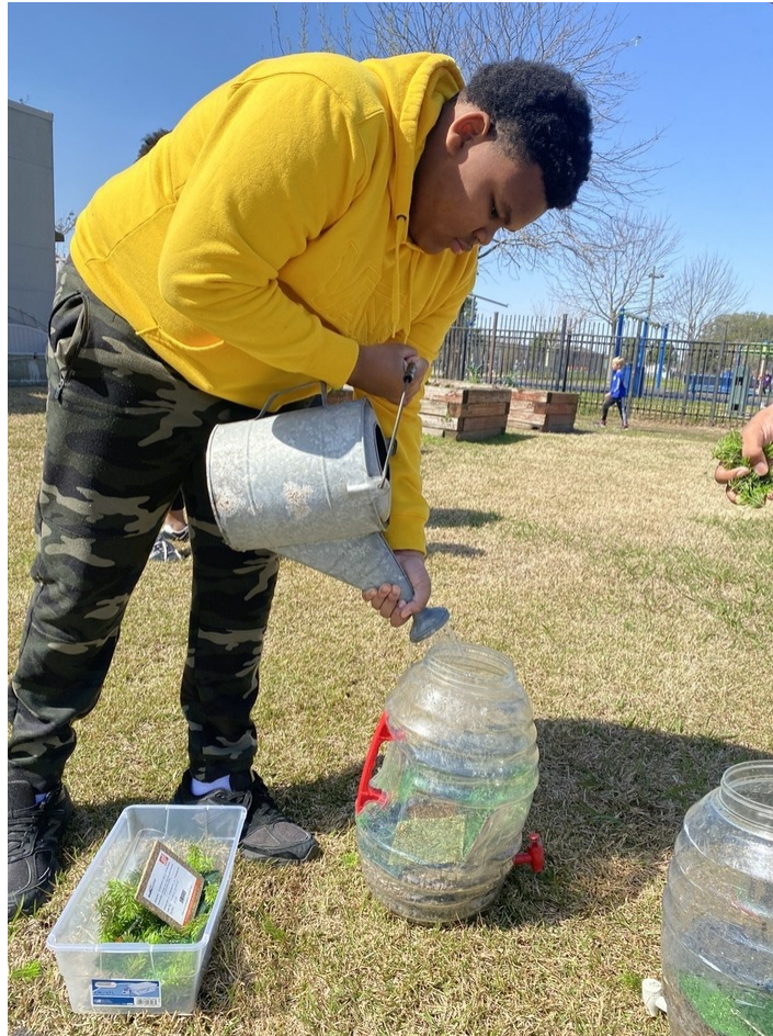
BASIN+ participants explore permeability